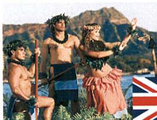
Hawaii's State Flag